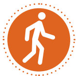
FREE FITBIT DEVICE