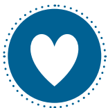
FREE HEALTH CHECK