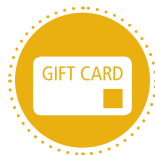
SHOPPING & ENTERTAINMENT*

Change the conversation with your clients — make it about living life to the fullest. To learn more, please go to JHredefininglife.com .