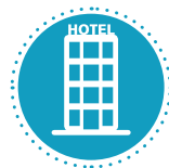
HALF-PRICE HOTEL STAYS*