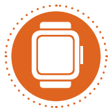
WEARABLE DEVICE DISCOUNTS