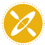
HEALTHY GEAR DISCOUNTS*